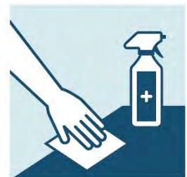
Keep objects and surfaces clean

Call your doctor again if you are getting worse. Call back if you are having trouble breathing. Do what your doctor says.