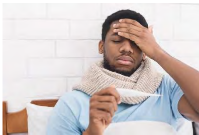
A fever of 100.4° or higher